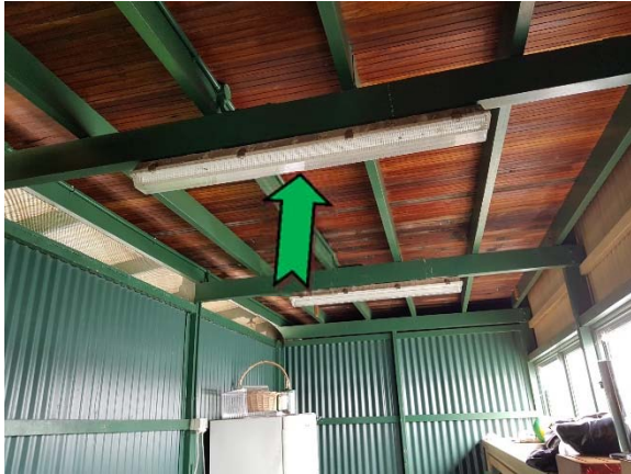
Photo 1. Exterior, throughout, single tubed fluorescent light fitting – suspected non PCB-containing capacitors.