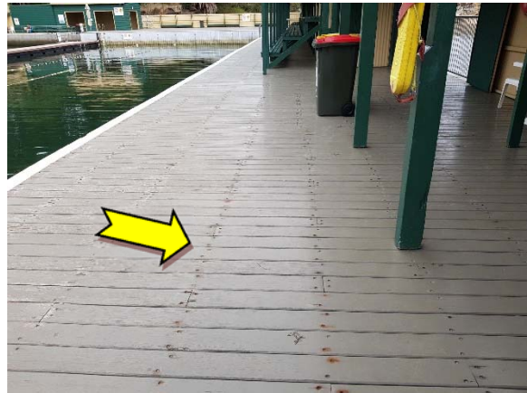
Photo 4. Exterior, throughout, floor – suspected lead-containing green upper paint systems.