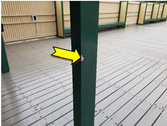
Photo 3. Exterior, throughout, beams – suspected lead-containing pink lower paint systems.