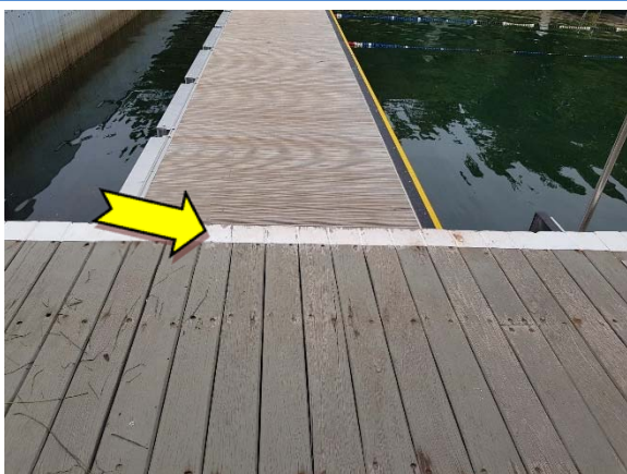
Photo 5. Exterior, throughout, edge of floor – suspected lead-containing white upper paint systems.