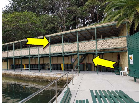
Photo 2. Exterior, throughout, walls and beams – suspected lead-containing yellow and green upper coloured paint systems.